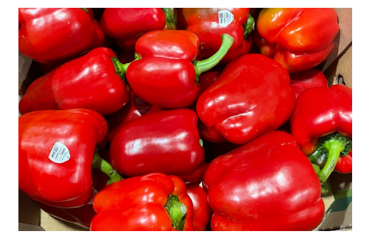
OG COLOR BELL PEPPERS Organic Color Bell Peppers are coming in strong from Israel and Mexico with exceptional quality.

Early April has seen a dip in production from both regions with transitions on the horizon as imports shift from Israel to Holland and Mexico to Canada as the month progresses. Despite this, expect solid supplies and great quality through mid-April.