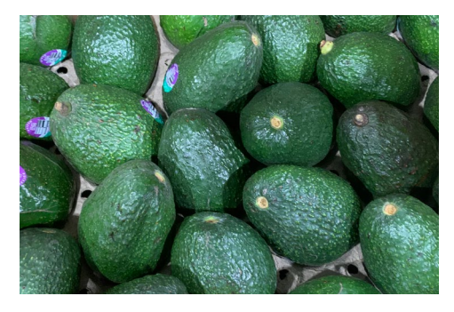
OG AVOCADOS Organic Hass Avocados are in decent supply.

Bulk Organic Green Beans are available for early April from some other growing regions.