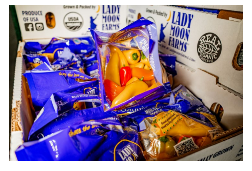
OG LADY MOON FARMS PEPPERS

Lady Moon Farms continues to have great supply and quality on Organic Jalapeños , Shishitos , and Mini Snack Peppers .