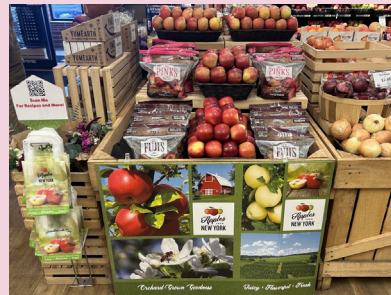
HENNING'S SUPERMARKET Harleysville, PA