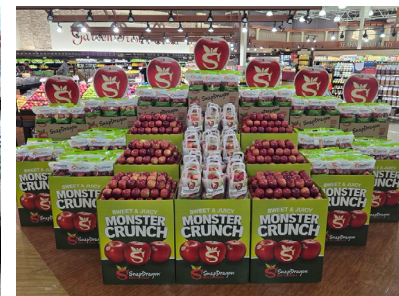
LOVETTSVILLE CO-OP MARKET Lovettsville, VA