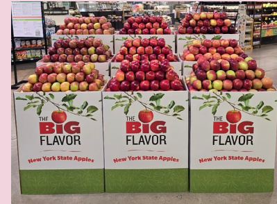
GREENSTAR FOOD COOP Ithaca, NY