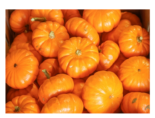
Code: 4822 JACK-BE-LITTLE (MINI-PUMPKINS) 40 ct case PLU: 4734