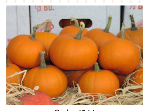
Code: 4944 PUMPKIN LITTLES (Hardball size Pumpkin) 20 ct case PLU: Retailer–Assigned