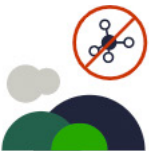
Reduced Landfill Methane