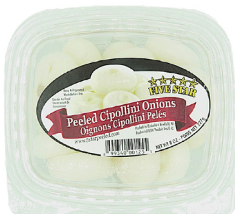
CODE: 223161 CV Onions Cipollini Peeled