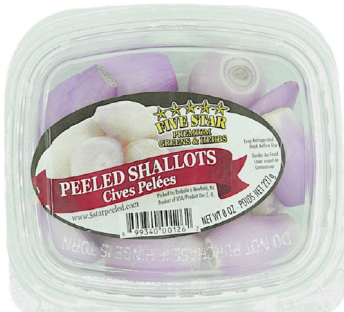
CODE: 233159 CV Onions Shallots Peeled