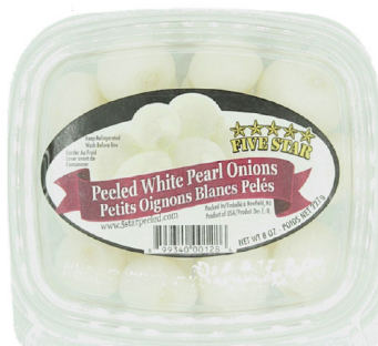
CODE: 233165 CV Onions Pearl White Peeled