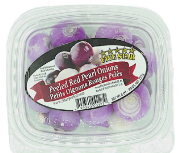
CODE: 223163 CV Onions Pearl Red Peeled