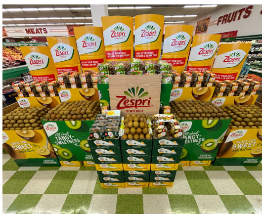
WEAVERS MARKET Adamstown, PA