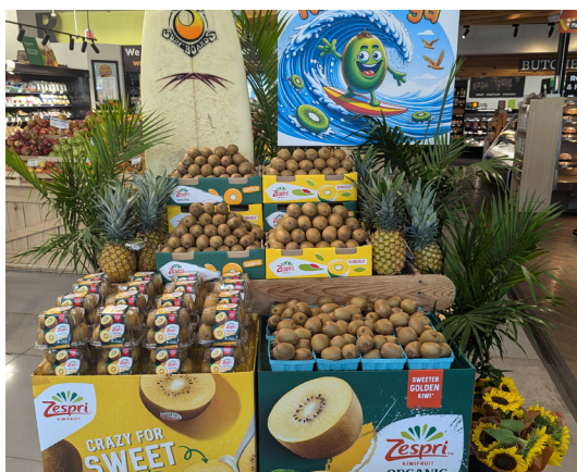
WEAVERS WAY CO-OP Ambler, PA