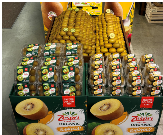
LEG UP FARMERS MARKET York, PA