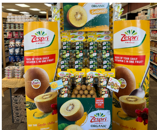
BUNN'S NATURAL FOODS Southampton, PA