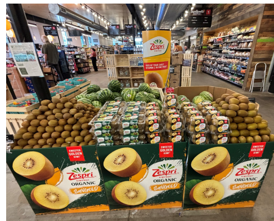
SUNFLOWER MARKET Woodstock, PA