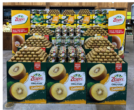
WEAVER'S FARM MARKET Morris, NY