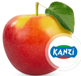
OG Kanzi: Sweet-sour & Juicy

GOOD NEWS! New crop first Organic SugarBee, Envy, and Lady Alice Apples of the season are now available. A steady supply is expected of these premium varieties.