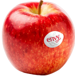
OG Envy: Balanced flavor & Crunchy