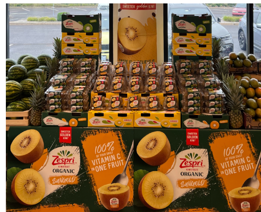
SOULBERRY NATURAL MARKET New Hope, PA