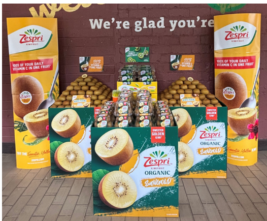
EAST AURORA COOP East Aurora, NY