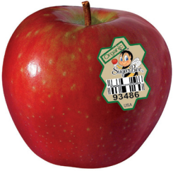
OG SugarBee: Sweet & Crisp!