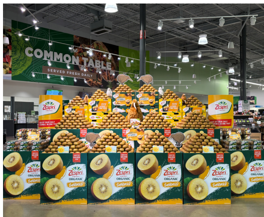
COMMON MARKET 7TH STREET Frederick, MD