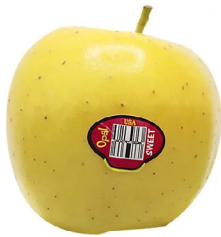
OG Opal: Crunchy-sweet, slow to brown when cut