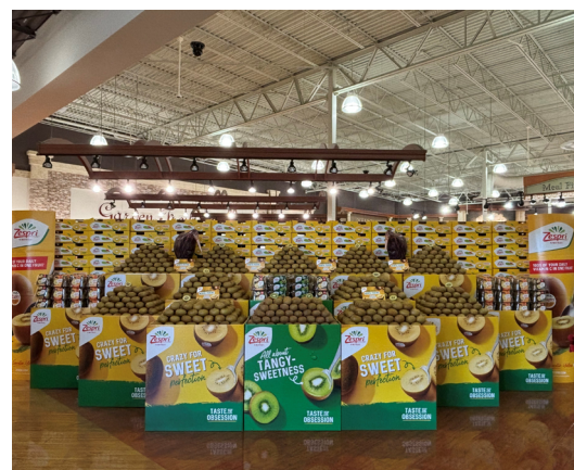
HENNING'S SUPERMARKET Harleysville, PA