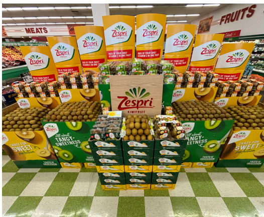
WEAVERS MARKET Adamstown, PA