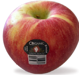
OG Lady Alice: Complex Sweet-Tart, Dense