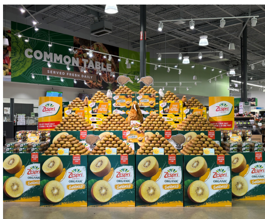
COMMON MARKET 7TH STREET Frederick, MD