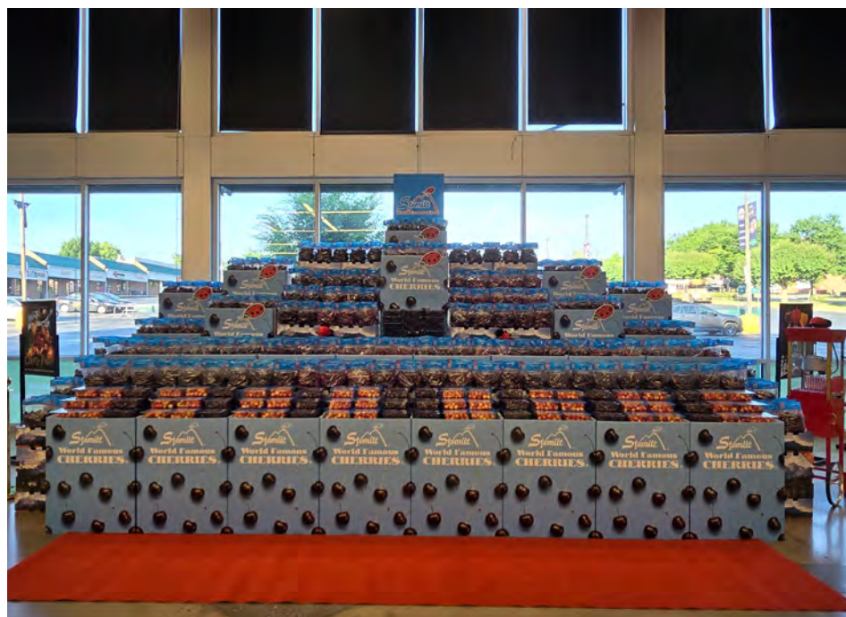
COMMON MARKET 7TH STREET Frederick, MD