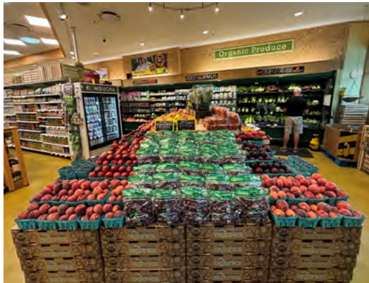
KIMBERTON WHOLE FOODS Downingtown, PA