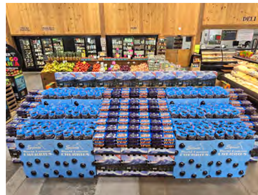
WEAVER'S FARM MARKET Morris, NY