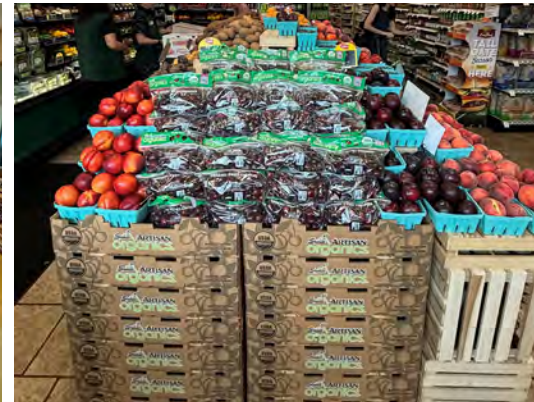
KIMBERTON WHOLE FOODS Malvern, PA