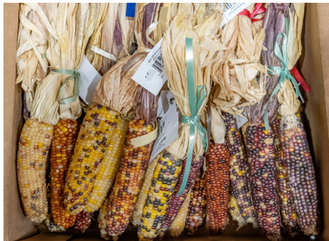
Code: 214039 MINI INDIAN CORN Display box 16/3 ct case UPC: 743425-40076