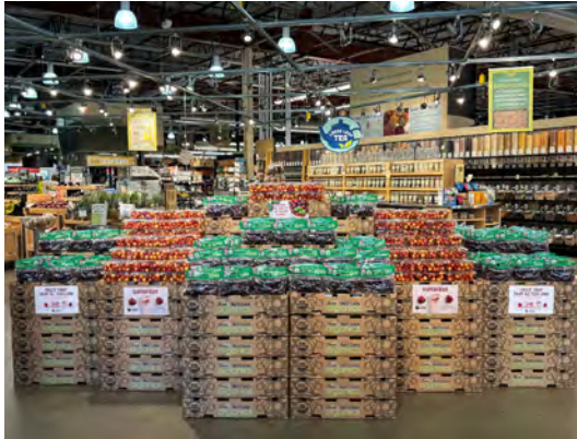
HEALTHY LIVING MARKET Saratoga Springs, NY