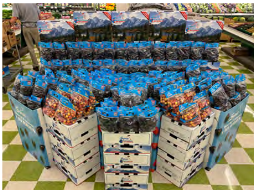
WEAVERS MARKETS Denver, PA

RISING TIDE NATURAL MARKET Glen Cove, NY