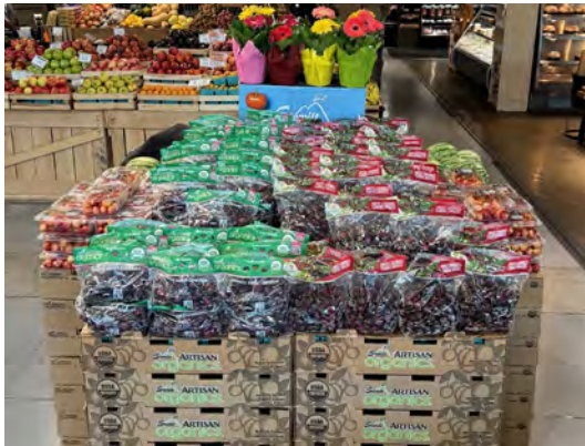
WEAVERS WAY CO-OP Ambler, PA