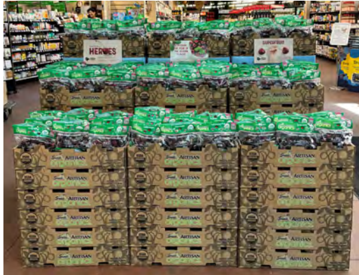
BRATTLEBORO FOOD CO-OP Brattleboro, VT