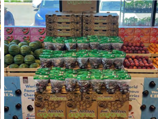
SOULBERRY NATURAL MARKET New Hope, PA