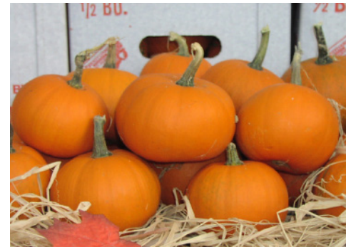
Code: 4944 PUMPKIN LITTLES (Hardball size Pumpkin) 20 ct case PLU: Retailer-Assigned