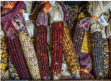
Code: 4901 INDIAN CORN 16/3 ct case UPC: 033383-40077