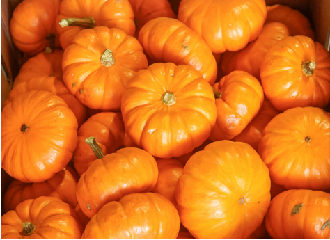
Code: 4822 JACK-BE-LITTLE (MINI-PUMPKINS) 40 ct case PLU: 4734