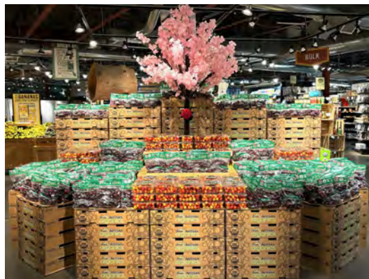
HEALTHY LIVING MARKET Burlington, VT