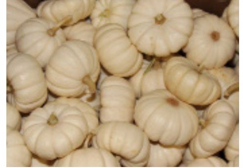
Code: 214521 WHITE JACK-BE-LITTLES (BABY BOO) 40 ct case PLU: 4734