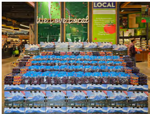
GREEN STAR FOOD CO-OP Ithaca, NY