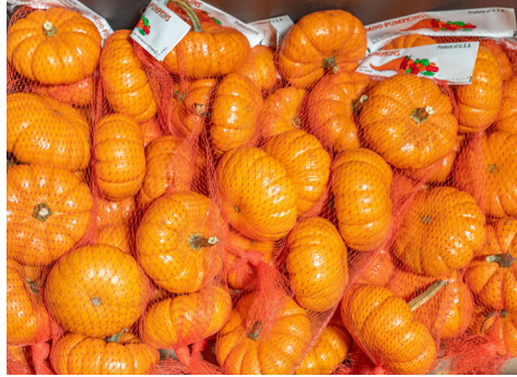
Code: 4929 JACK-BE-LITTLES BAGGED 14/5 ct case UPC: 743425-08950