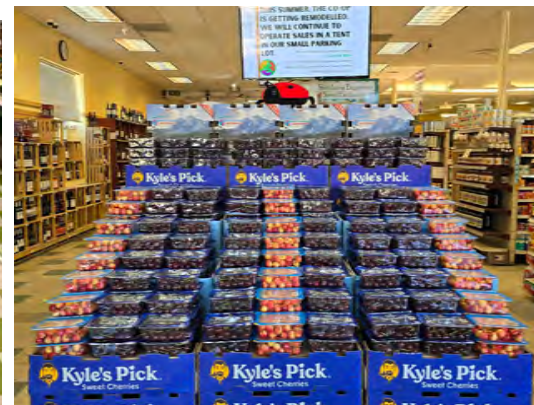
TAKOMA PARK FARMERS MARKET Takoma Park, MD