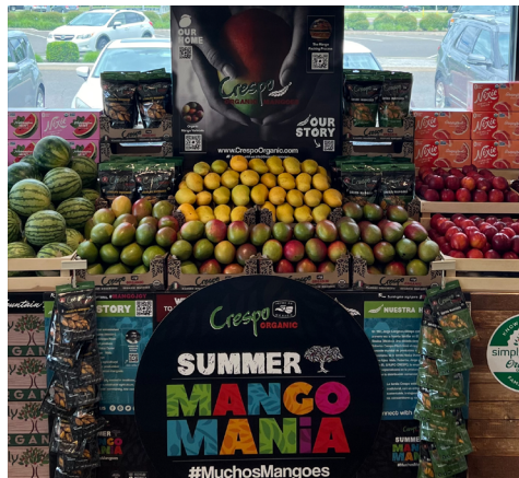
SOULBERRY NATURAL MARKET New Hope, PA