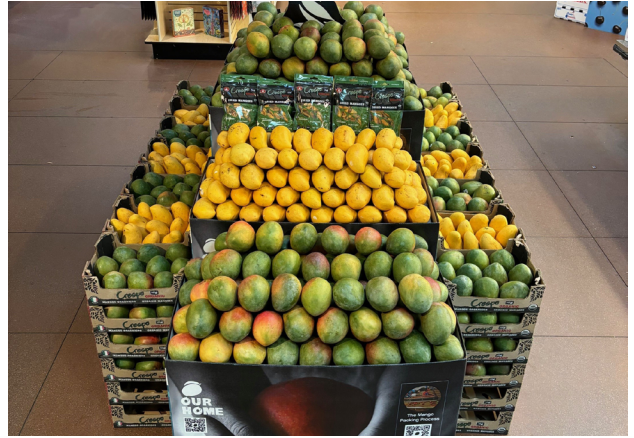
BRATTLEBORO FOOD CO-OP Brattleboro, VT