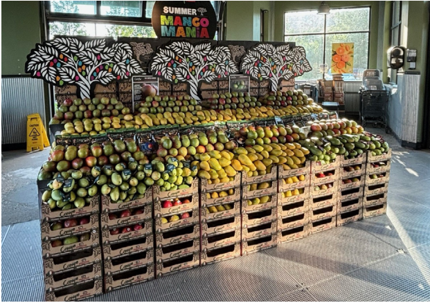
HEALTHY LIVING MARKET Burlington, VT