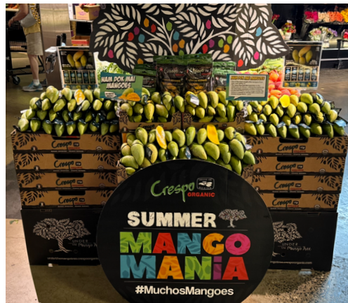
MCCAFFREY'S FOOD MARKET West Windsor, VA

https://www.instagram.com/reel/C95Ya2YJ8N6/