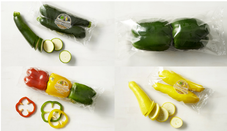
J&J FIELD-GROWN VEG