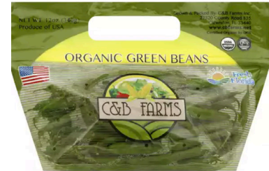
OG & CV BAGGED GREEN BEANS