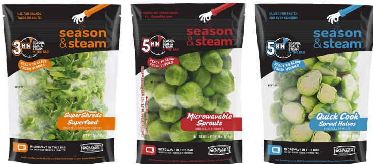
OCEAN MIST BRUSSELS SPROUTS