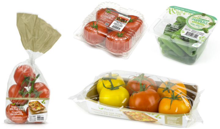
MUCCI GREENHOUSE VEG