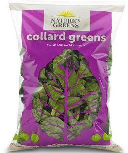
OG & CV NATURE'S GREENS VEG