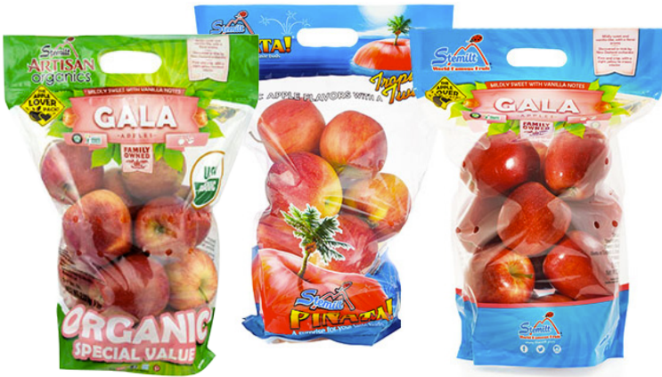
STEMILT POUCH APPLES

Due to change in consumer demand, pre-packed items are selling very well. Consult with your rep about these ideas and more.