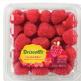
DRISCOLL'S SEASON'S FINEST, RAINBOW BERRIES, & BERRY BIG STRAWBERRIES