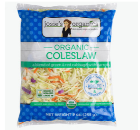
JOSIE'S ORGANICS COLESLAW