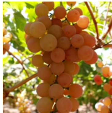
CV GRAPES PINK MUSCATEL IMPORT (LIMITED TIME THROUGH MID-MAY)