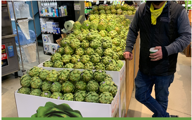
Henning's Market - Harleysville, PA