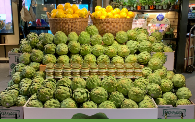
City Market - Burlington, VT